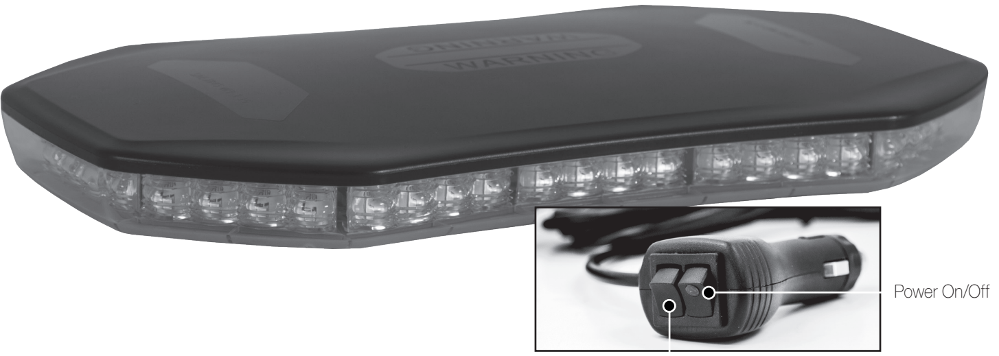
Flash Pattern Selector